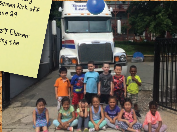
Bottom right: Future Teamsters' Elementary school students enjoy exploring the Local 25 truck