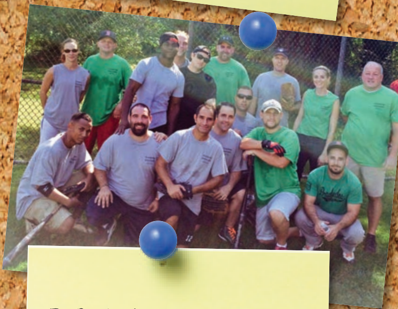
Top: Play ball! Local 25 helped the Rhode Island Teamsters Horsemen Chapter 10 raise funds for research for spinal injuries at a charity softball game on September 19