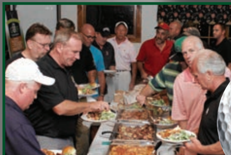
Golfers gather for dinner and awards