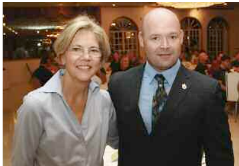
U.S. Senator Warren and President O'Brien