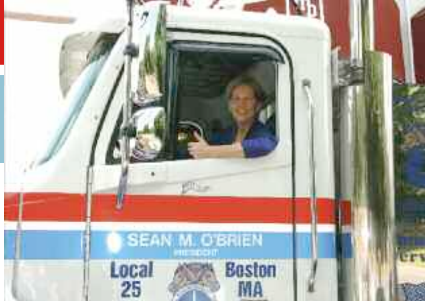
U.S. Senator Warren in the Local 25 truck

U.S. Senator Warren is now the senior senator from Massachusetts. The special election to succeed U.S. Sen. John Kerry will take place on June 25. Stay tuned to our web site for more details on this race.