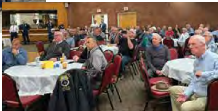
Right: It was great to see so many members in attendance at the October breakfast