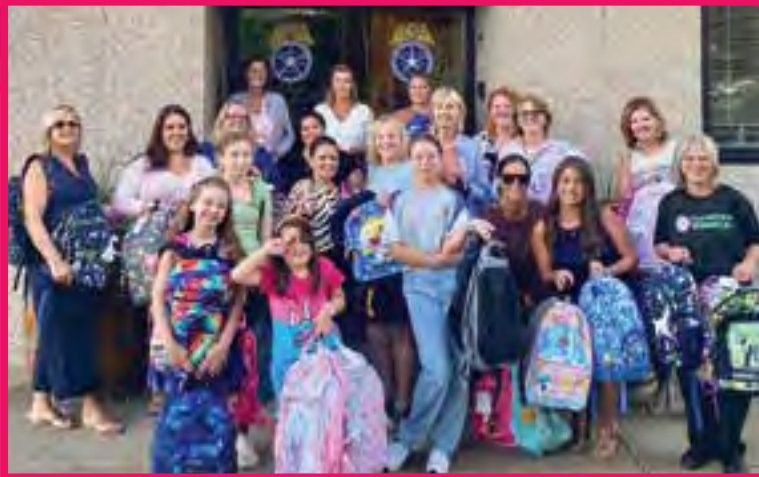
Right: Sisters at the Union Hall assembled hundreds of backpacks in just a few hours