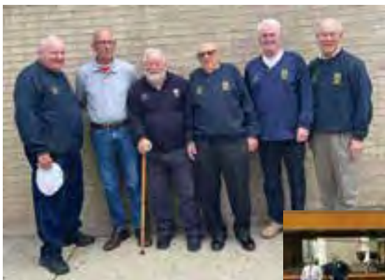
Above: The Teamsters Local 25 Retiree Chapter Executive Board