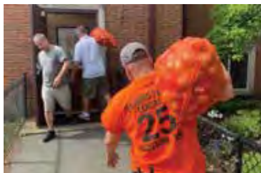
Volunteering at Saint Monica's Food Pantry

In September was the state primary and our members played a large role in helping many candidates claim victory. We had boots on the ground throughout the summer for Local 25 endorsed candidates. This included door-to-door canvassing,